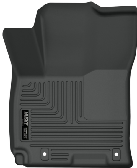
LEFT OR DRIVER'S