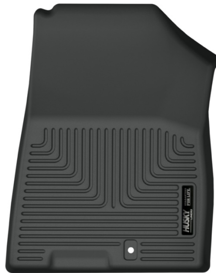
RIGHT OR PASSENGER'S

TO EASE INSTALLATION OF YOUR NEW FRONT LINERS, MOVE BOTH FRONT ROW SEATS TO THEIR MOST REARWARD POSITION. WITH THIS DONE, INSTALL THE LINERS AS SHOWN ABOVE. THE DRIVER AND PASSENGER SIDE LINER WILL ATTACH TO THE FACTORY FLOOR MAT RETAINING POSTS. ONCE YOU HAVE INSTALLED YOUR LINERS, REPOSITION THE SEATS AS DESIRED.